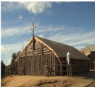
St Alipius Diggings School at Sovereign Hill